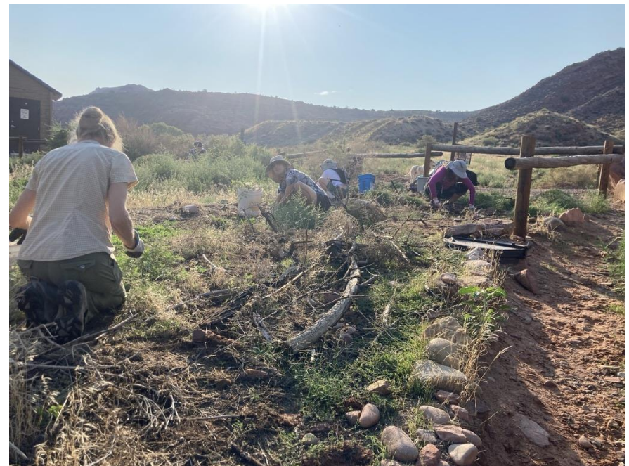
SEPTEMBER 2021 GOAT HEAD AND TUMBLE WEED REMOVAL PARTY, MOAB SOLUTIONS

particularly distinguished results of Survey #2, it is unclear that any of these plans presented by the MCCC are definitively the course of action the BLM should follow going forward.