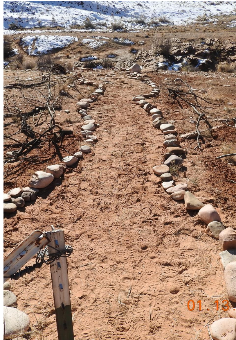
WINTER BREAK STUDENTS LINE TRAIL COMING DOWN FROM POTATO SALAD HILL